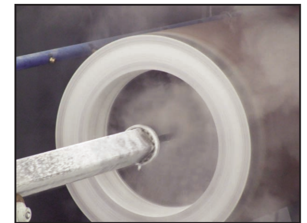
A MOULD BEING SPRAYED WITH A REFRACTORY COATING