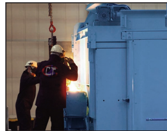
GCRH A MACHINE

Email: sales@gibsoncentritech.co.uk Web: www.gibsoncentritech.co.uk