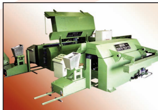
GCRH R MACHINE WITH COUNTER BALANCED GUARD

bimetal rolls for steel rolling mills, plus many other applications. Models are available that will exceed 25 tonne capacity. The machines use a variety of mould medias; permanent moulds of forged steel or cast iron steel flasks housing graphite or sand rammed lined moulds.